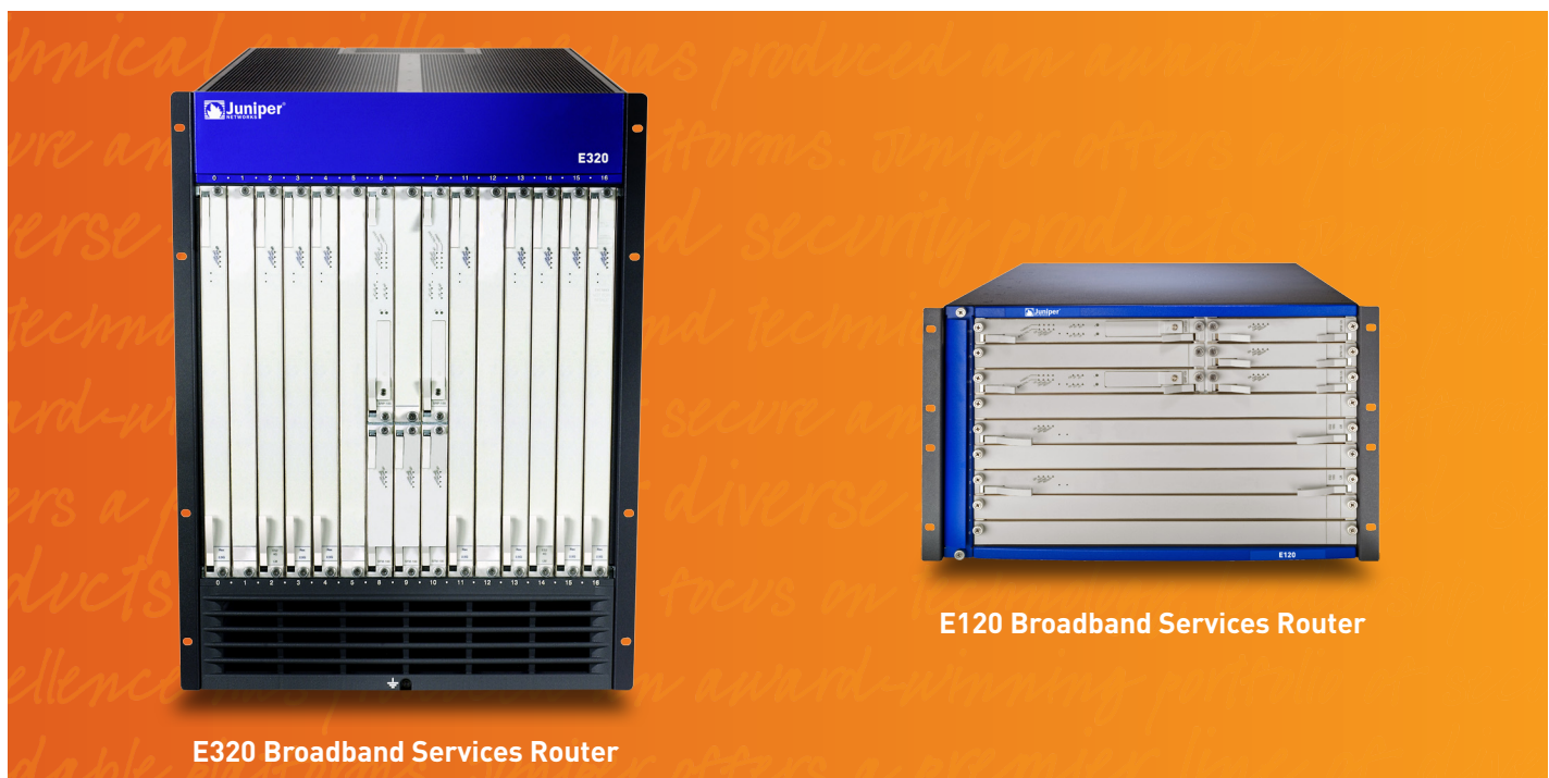
E320 Broadband Services Router