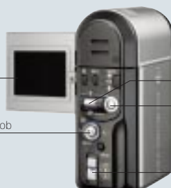
10x Optical Zoom/ 200x Digital Zoom