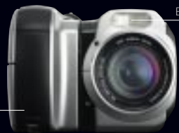
Built-in Auto Flash