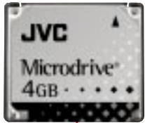
Microdrive® Removable Media

your PC with the convenience of high-capacity removable media.