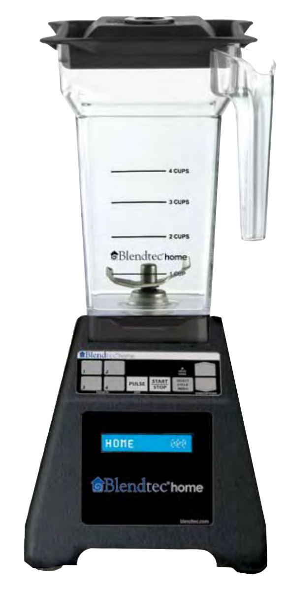
Model HP3A Instruction Manual