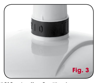
(KFA210 only offers 2 settings)