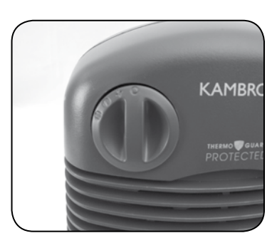
Plug the cord into a 230V or 240V power point and switch on.

Ensure the Heat Setting dial is turned to '0' for OFF position.