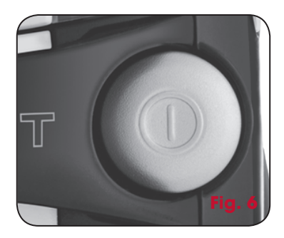
Turn off the vacuum cleaner when changing any tools. Follow the 'TO OPERATE THE VACUUM CLEANER' instructions to commence vacuuming.

Simply fit the hard floor tool to the narrow end of the wand and push together firmly.