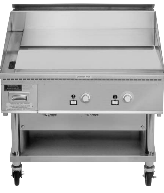
*Stand with casters or 4" legs are optional

The smooth MIRACLEAN<sup>®</sup> surface prevents food particles from being trapped as they are in steel plate griddles. The surface virtually eliminates flavor transfer.