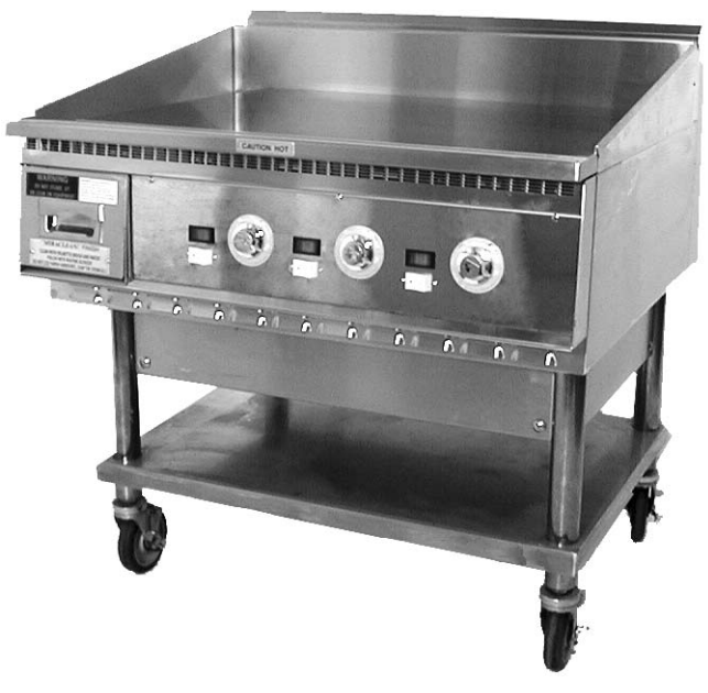
*Stand with casters or 4" legs are optional

The Keating MIRACLEAN® Griddle is designed to provide maximum performance with many benefits to the operator. The mirror surface of the MIRACLEAN® is achieved in a special eight step process. Insulated stainless steel electric elements are mounted every 12" to ensure performance and recovery and allows the operator to use zone cooking for different products.