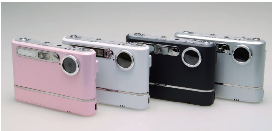
The camera comes in 4 colors : from left, pearl pink, white, navy blue and silver.

The camera is equipped with a 4-times digital zoom, and its gross sensor resolution is 5.03 million pixels.