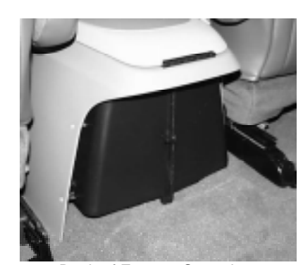
Back of Factory Console

Reinstall the rear radio controls into the video console by pushing in until it snaps into place. Install the mounting brackets onto the side of the video console. The brackets mount with the "V" shaped notch