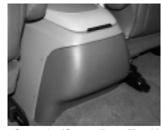
Factory Console (Super Duty Truck)