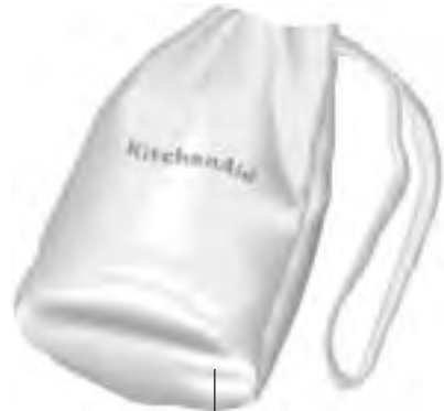
Storage Bag (Model KHB300 only)

Storage Bag (Model KHB300 only) Cotton Twill drawstring bag is designed with three distinctive pockets to store the Immersion Blender motor body, the stainless steel blending attachment, and the whisk attachment. Storage bag is machine washable.