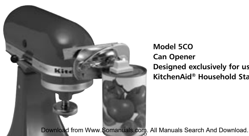
Model 5CO Can Opener Designed exclusively for use with all KitchenAid® Household Stand Mixers.