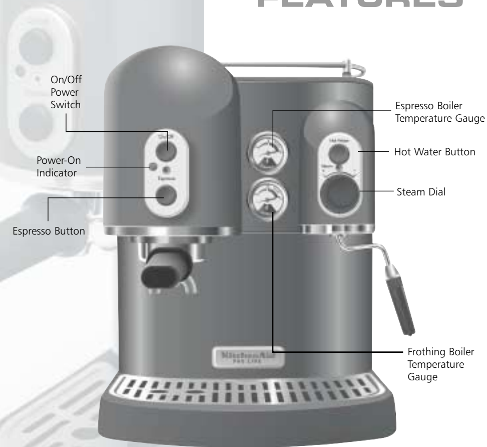
Model KPES100 Espresso Machine