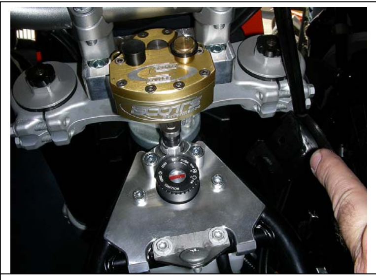
Parts are silver in this photo to show contrast for mounting ease.