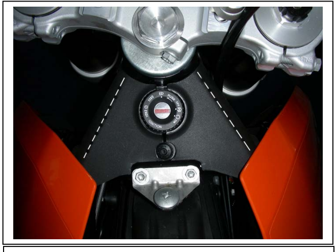
Cut the stock plastic key shrouds along the dotted lines until they match your frame to your satisfaction.