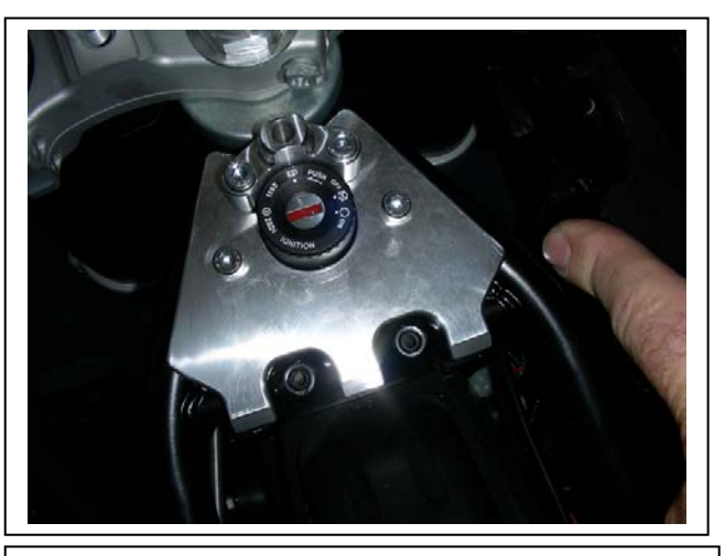
Move the top plate around until it's centered