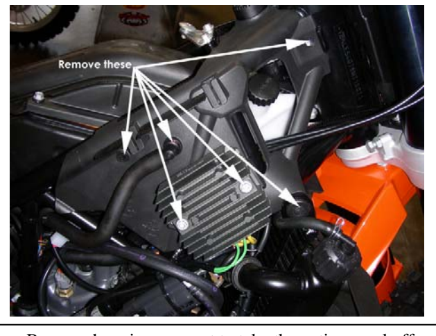
Remove here is you want to take the entire panel off