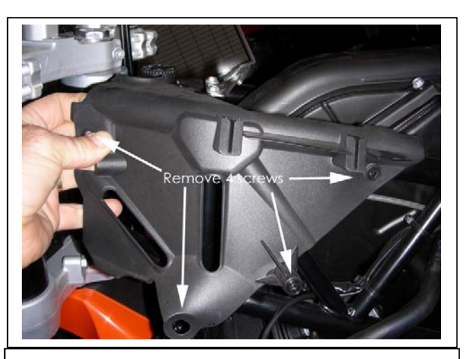
Remove screws here to remove left side panel