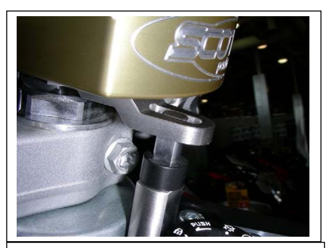
This is the correct tower pin height for this model. Be sure the tower pin does not extend through the slot too far as it can make contact with the damper body. Keep the tower pin greased in the hole.