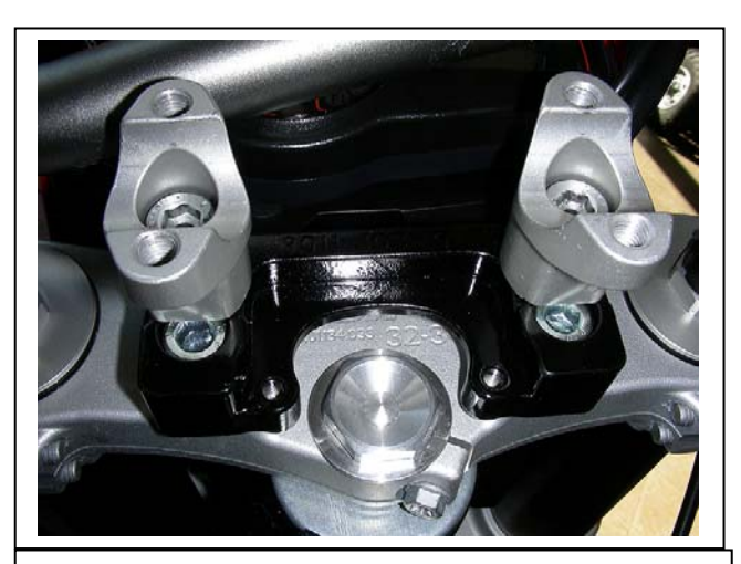
Install the black SUB mount first using the rear set of holes on the triple clamp and tighten the Allen bolts. Then install the stock lower perches and tighten. Perches can be reversed for optional bar positions.