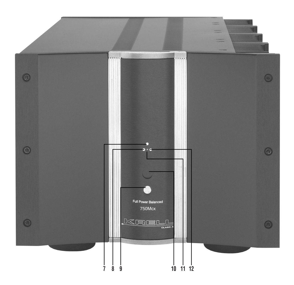
FIGURE 2 FULL POWER BALANCED MONAURAL AMPLIFIER FRONT PANEL