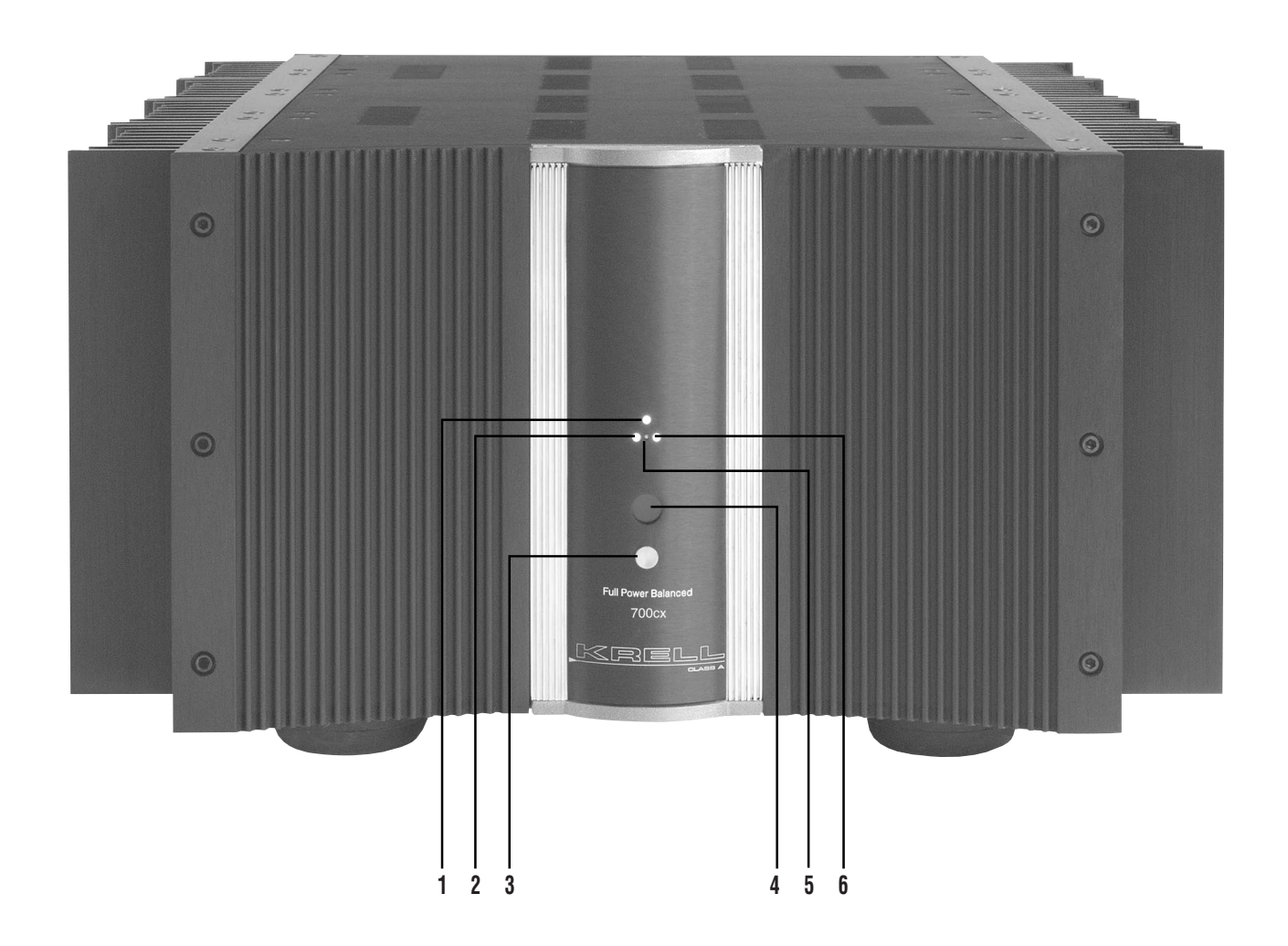
FIGURE 1 FULL POWER BALANCED STEREO AMPLIFIER FRONT PANEL