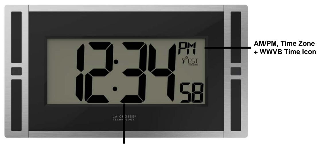
Hour, Minutes + Seconds

Get Support: www.lacrossetechnology.com/519-1416