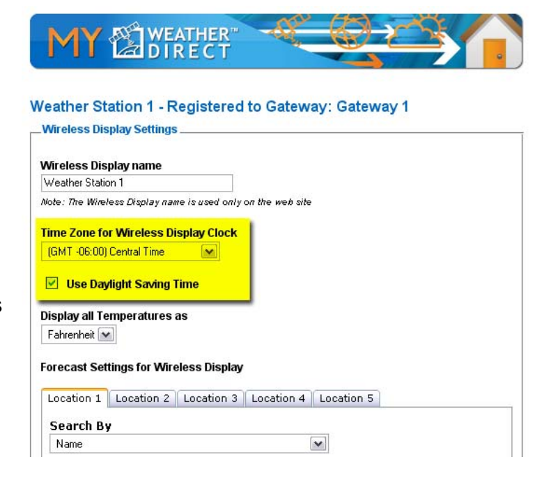
Page 9 of 25

The Time Zone you select on www.weatherdirect.com for your Wireless Display is intended to set the time for your physical location so the clock on your Wireless Display is accurate. This time is independent of your selected forecast locations. The Wireless Display will ONLY display the time from the "Time Zone for Wireless Display Clock" set on the web site, NOT the time at the forecast locations. There is only one Time