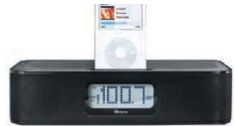
Listen or wake up to your favorite stations on the digital AM/FM radio