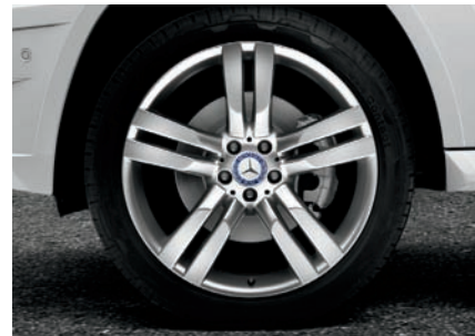
Optional 20" twin 5-spoke (Appearance Package)