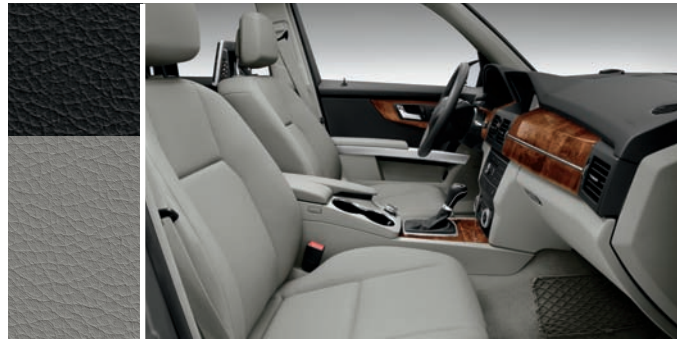
Grey/Black (requires Full Leather Seating Package)