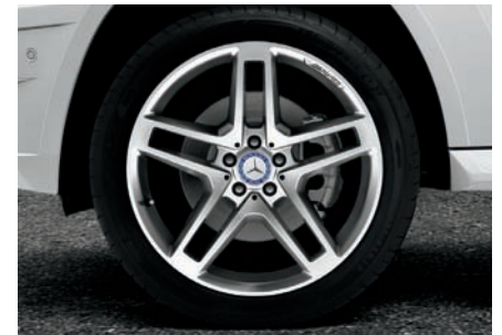
Optional 20" AMG twin 5-spoke (AMG Styling Package)