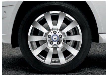
Standard 19" 10-spoke