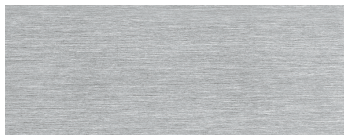
Aluminum (requires Black MB-TEX upholstery)