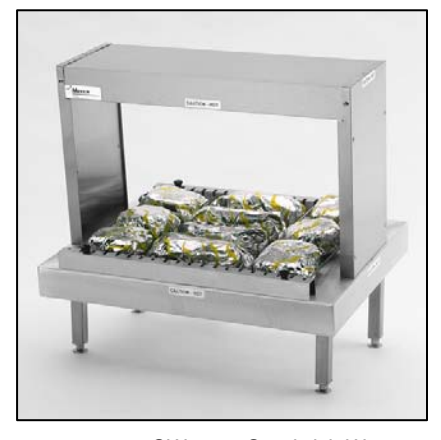
SW-2418 Sandwich Warmer

Merco Savory, LLC 1111 North Hadley Road Fort Wayne, Indiana 46804 United States of America Technical Support Hotline: (800) 678-9511