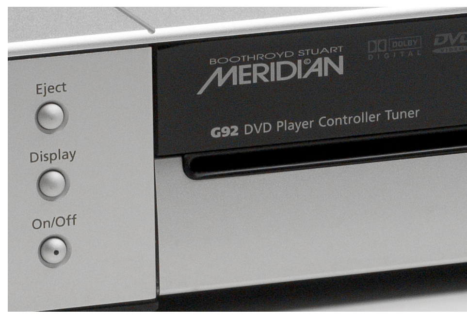
G92 features a slot-loading DVD-ROM drive

The HDMI output can be connected to a DVI input if the device supports HDCP copy protection, using a suitable adaptor cable.