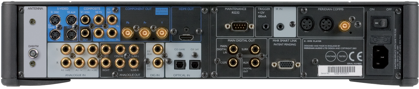
G92 DAB rear panel

In addition, the G92 incorporates digital surround decoding to allow the multichannel analogue and digital outputs to be used to drive a 5.1 surround system directly, based on Meridian DSP Loudspeakers and/or conventional analogue amps and speakers.