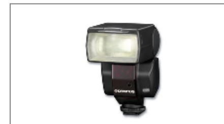
Metz 48 AF-1 digital