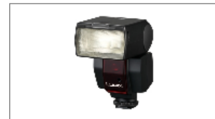
Metz 48 AF-1 digital