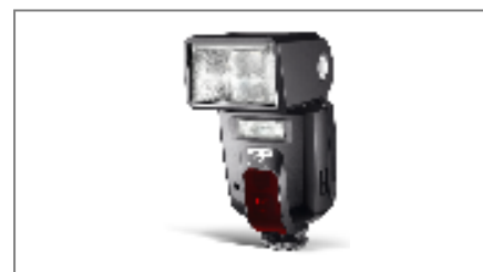
Metz 58 AF-1 digital