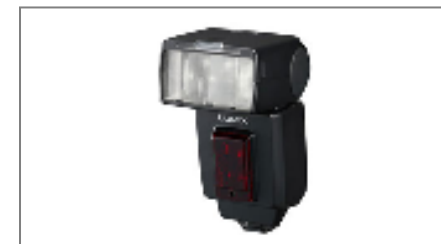
Panasonic DMW-FL 500E