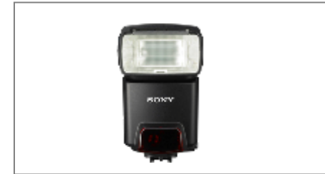
Sony HVL-F 42 AM