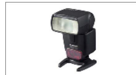
Metz 48 AF-1 digital