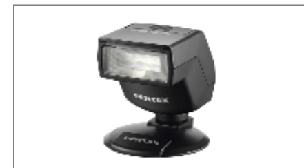
Pentax AF 200 FG