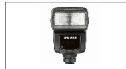
Metz 48 AF-1 digital