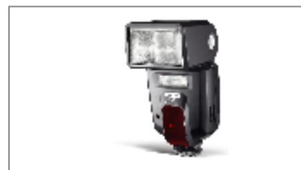
Metz 58 AF-1 digital