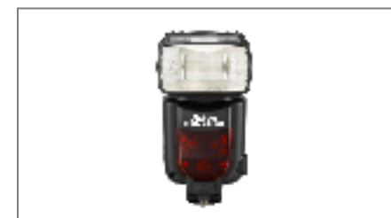
Nikon SB 900