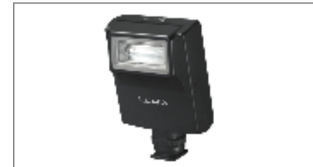
Panasonic DMW-FL 220