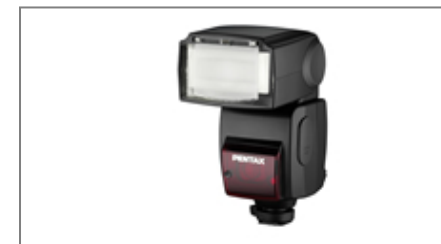
Samsung 54 PFZ