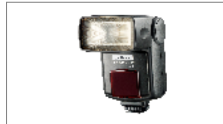
Metz 36 AF-4 digital