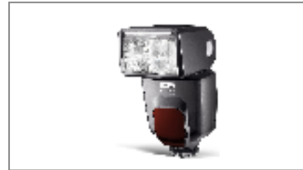
Metz 48 AF-1 digital