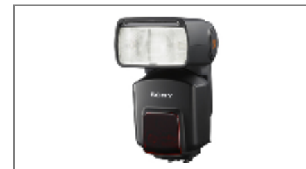
Sony HVL-F 58 AM