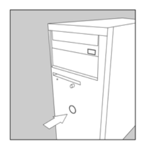
Turn on your computer.

During the software installation, you <u>must</u> install the DRIVER. You can install the Arcsoft® PhotoImpression and VideoImpression software at a later time. Frequently check for updated webcam software by visiting our website, www.microinv.com.