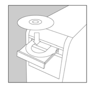
Insert the CD into your PC and follow the on-screen instructions.

Note: In order for you to use your webcam you must install the software before plugging the webcam into your PC.