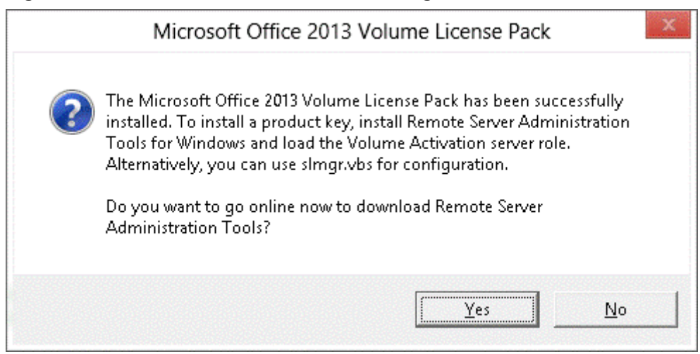
Figure: Office 2013 Volume License Pack dialog box