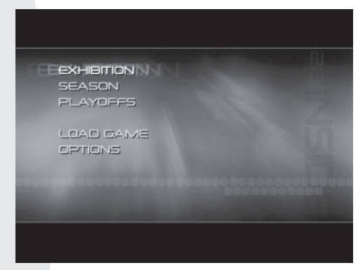
This is where it all begins.

Before you can get on the court, you've got to decide what kind of ballin' you want to do. First off, make your selection from the Main Menu.