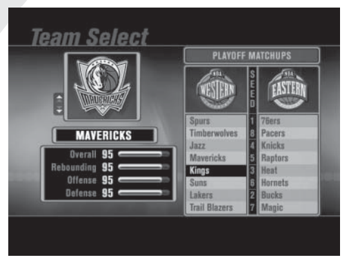
Don't let this kind of power go to your head.

On the Team Select Menu, you can put any team you want into the playoffs and match them up against any other team.