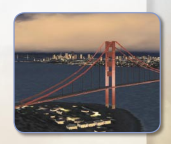
San Francisco at Dusk