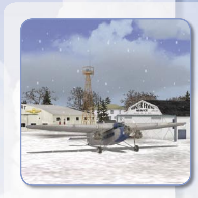
The Ford 4-AT Tri-Motor prepares for takeoff in the "Winter Wonderland" weather theme.

weather system. Flight Simulator now features Dynamic Weather ; three-dimensional clouds build and change realistically with the temperature and time of day, and even blow across the sky. The dynamic weather system also generates rain, snow, and fronts that develop based on atmospheric conditions.