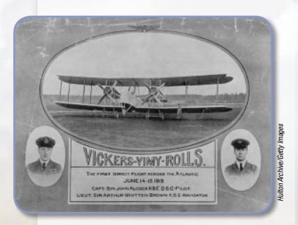
Posters celebrated the Vickers Vimv's nonstop transatlantic crossing.

IT'S BEEN A FULL CENTURY since the Wright Flyer's first powered flight. At first, the skies were empty and the airspace unrestricted. It was an age of slow speeds, spruce-and-fabric wings, and airfields that were also corn fields. In the following decades, aviation filled the skies with beautiful aircraft and awesome adventure, while technology allowed pilots to travel through all kinds of weather. Within a few decades of the birth of powered flight, pilots and passengers were soaring across continents, racing over oceans, and jetting around the world in less than a day. It was a century when the airplane brought distant lands closer and changed people's sense of space and time—a century when the world learned to fly.