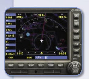
Flight Simulator models sophisticated GPS receivers.