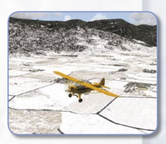
Wyoming in Winter