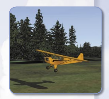
Well into the age of jets. a Piper Cub revives the roots of aviation.

Simulator-related information and links to Flight Simulator sites worldwide that offer a variety of downloadable scenery, panel, and aircraft add-ons.