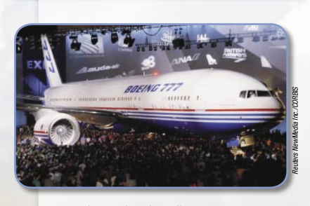
Latest in a long lineage: The Boeing 777's rollout, April 9, 1994.

lounge, the briefing room, or the airport restaurant—whenever pilots and aviation enthusiasts gather for more than a few minutes at a time. For Flight Simulator pilots, one of the favorite gathering places is on the Web, at any one of the many sites for Flight Simulator enthusiasts.