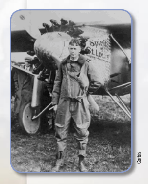
Charles Lindbergh with the Spirit of St. Louis

THE FIRST PILOTS spent much of their time flying precariously at exhibitions and in aerial circuses. But it wasn't long before they attempted long-distance travel. In 1911, the first aircraft flew across the entire United States when Calbraith Rodgers piloted his "Vin Fiz" Wright EX biplane from New York to Long Beach, California. During the 49-day journey, Rodgers spent more than 82 hours in the air and crashed 69 times.