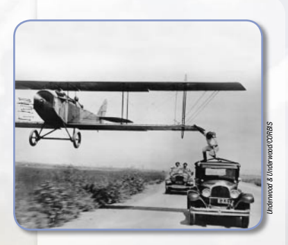
The Curtiss Jenny starred in many antics during the barnstorming years.

FOR THOUSANDS OF PILOTS who learned to fly in the Curtiss JN-4D "Jenny" during World War I, the postwar skies were an open opportunity. Barnstormers looped and swooped above gasping crowds and, for many people, airplanes were still such a new sight that nearly every flight was an impromptu air show. The Curtiss Jenny, which performed in many such spectacles during the 1920s, introduced the public to flight.