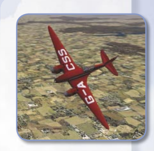
The DH-88 Comet races to Melbourne, Australia, in Flight Simulator.

To learn more about pilotage and dead reckoning, read the Old-Fashioned Navigation article in the Learning Center.