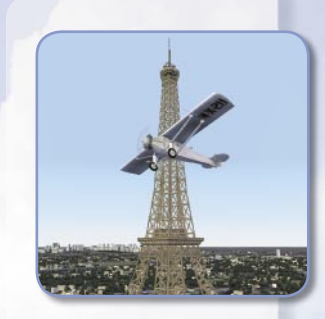
The Spirit of St. Louis circles above Paris in Flight Simulator.

In the spring of 1927, aviators lined up for another challenge: flying nonstop from New York to Paris. Many had already failed when Charles Lindbergh tried a new and daring approach—simplicity—using a single-engine plane flown by a single pilot. Lindbergh bounced down the muddy runway at Roosevelt Field in the cloudy dawn of May 20, and the world held its breath for more than 33 hours as Lindbergh's airplane was sighted at various points en route. At long last, the buzz of an engine was heard over Paris and the small silver airplane circled, landed, and rolled to a stop. Suddenly, Paris and New York were closer to each other, and pilots gained a new perspective on distance and terrain.