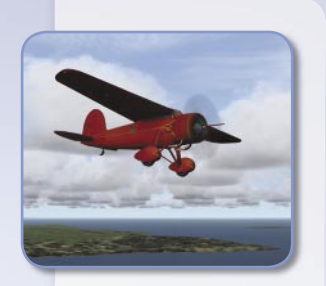
Amelia Earhart's Vega in Flight Simulator

Each Century of Flight story includes links to re-created historical flights. After reading about each aircraft, its famous flights, and its notable pilots, you can fly into history—piloting the de Havilland DH-88 Comet in the MacRobertson Air Race, or flying an early airline route through the Rocky Mountains in a Douglas DC-3.