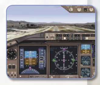
Compare the cockpits of the Curtiss Jenny (top), the Vega (middle), and the Boeing 777–300 (bottom), and see the evolution of instrumentation during flight's first century.