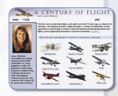
A Century of Flight