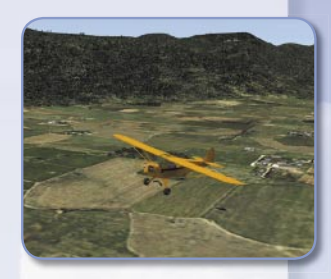
Wyoming in Summer

To learn more, read the Time and Season article in the Learning Center.