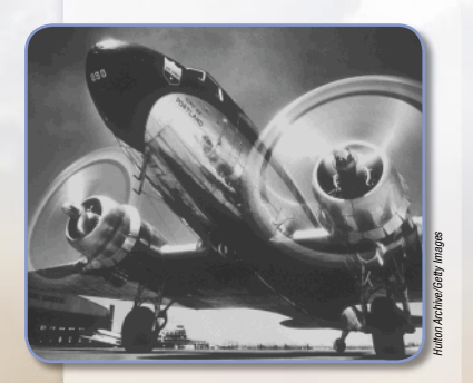
The Douglas DC-3 quickly became the hero of many early airlines.

The swift and reliable Douglas DC-3, which was able to carry more people than the Ford Tri-Motor and with greater speed and efficiency, became one of the most widely used transportation aircraft in the world during the 1930s and 1940s.