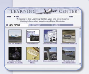
The Learning Center

Navigating through the Learning Center is much like browsing the Web; each article includes related links that connect you to other articles. The Learning Center also offers three different ways to find information: Key Topics presents a visual way to explore major Flight Simulator themes, the Site Map offers a comprehensive table of contents, and the Index allows you to find articles by topic.