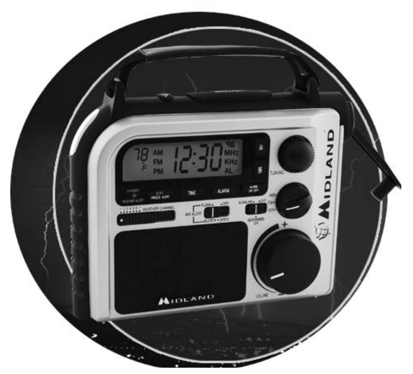
ER102 | Emergency Crank Weather Radio Owner's Manual