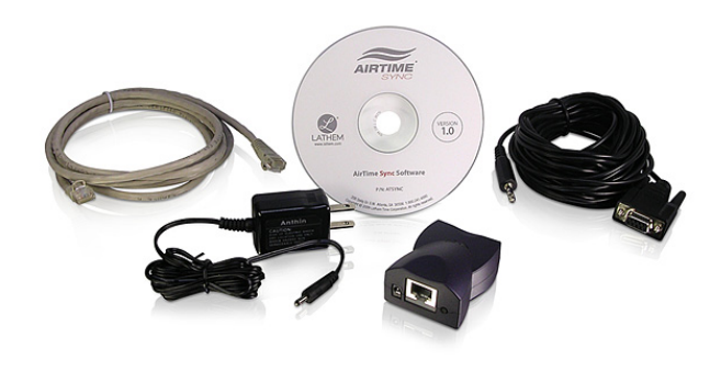
Pack Contents: ATSYNC Software CD, TXTOSER Adapter and SAE0370 Cable, 25FT.

An ATSYNC icon appears in the system tray to indicate that the service is operating. A log file is available to verify if update events were successful and provides time and date of each past occurrence. You can manually update your Transceiver at any time by clicking the Set Time button.