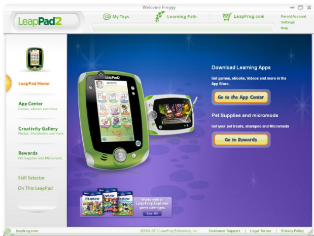
LeapFrog Connect Application for LeapPad

Your first connection may take a few minutes to download, so we encourage you to connect your new device when you have the time.