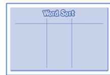
Back of mat