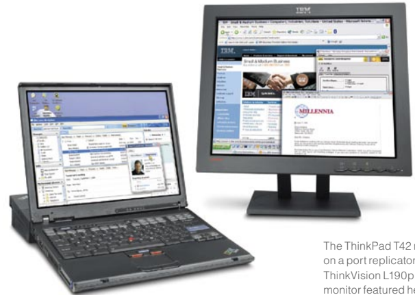
The ThinkPad T42 notebook on a port replicator and ThinkVision L190p flat panel monitor featured here are sold separately.

For important warranty information, see footnotes on the back panel.