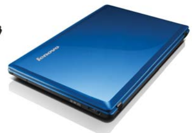
Lenovo G480/G580 Blue (Glossy)