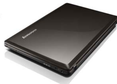
Lenovo G480/G580 Dark Brown (Glossy)