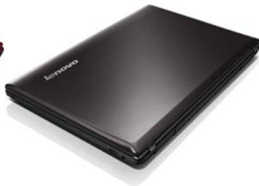
Lenovo G480/G580 Dark Brown (hairline)