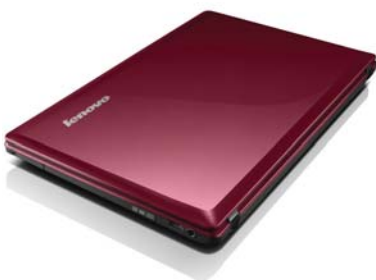
Lenovo G480/G580 Red (Glossy)