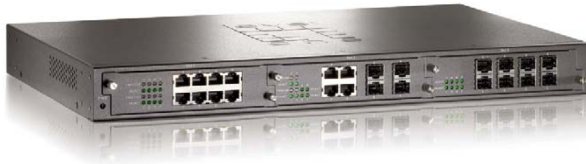
Figure 2-1 The Front Panel of the GSW-2453

The Front Panel of the GSW-2453 consists of 3 module slots.