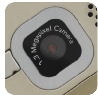
1.3 Megapixel Camera & Camcorder