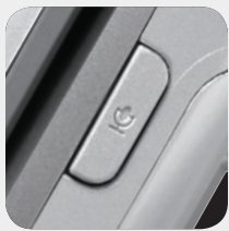
Voice-Activated Dialing Key