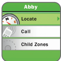
Chaperone Family Locator Service

* Certain features may use more power and cause actual standby and usage time to vary.