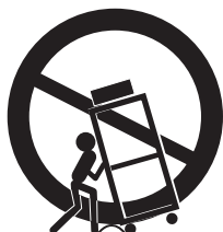
PORTABLE CART WARNING

Do not place this product on a slippery or tilted surface, or on an unstable cart, stand, tripod, bracket, or table. The product may slide or fall, causing serious injury to a child or adult, and serious damage to the product. Use only with a cart, stand, tripod, bracket, or table recommended by the manufacturer, or sold with the product. Any mounting of the product should follow the manufacturer's instructions, and should use a mounting accessory recommended by the manufacturer.