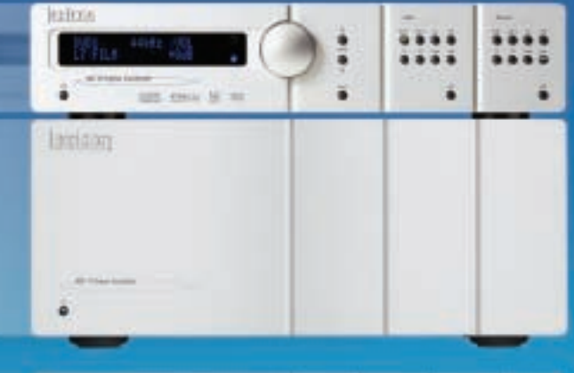
RX-7 Power Amplifier shown with MC-8 Digital Controller