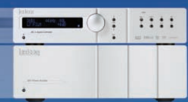
GX–7 Power Amplifier shown with MC–4 Digital Controller

The ZX-7 & RX-7 feature true balanced topologies. This approach results in lower noise, lower distortion, and eliminates interference from external stray electronic fields. Music reproduction benefits from a cleaner soundstage and increased dynamics, while the presentation of subtle detail is improved appreciably due to the significantly lower noise floor. Designed for the enthusiast, Lexicon power amplifiers are the perfect complement to our award-winning Digital Controllers & Disc Transports, and are ideally suited to power the world's finest listening systems.