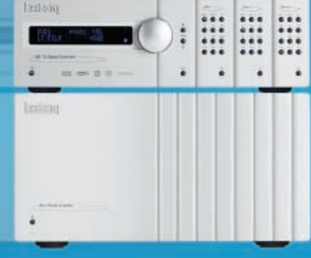
ZX-7 Power Amplifier shown with MC-12HD Digital Controller