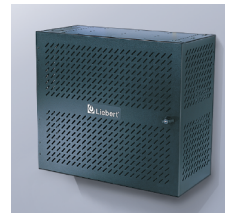
Low Profile Unit

Two standard designs are offered: a Hinged Body model (with a nominal height, depth, width of 24" x 24" x 24") and a Low Profile unit (nominal 24" x 12" x 24").