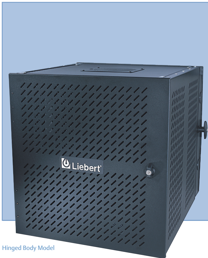
Hinged Body Model

Liebert Foundation Wall Mount Enclosure systems provide an effective solution for these limited space equipment mounting applications — where both protection and security are required.