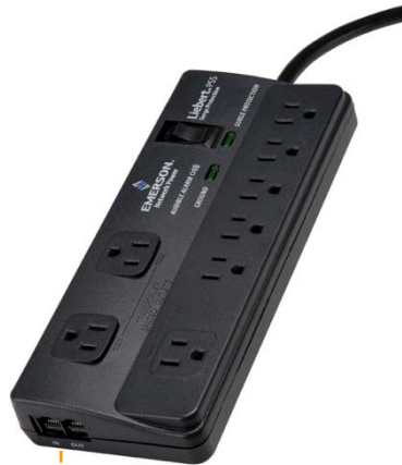
NET1080T Includes complete phone and network surge protection

Liebert Corporation 1050 Dearborn Drive P.O. Box 29186 Columbus, Ohio 43229 800 877 9222 Phone (U.S. & Canada Only) 614 888 0246 Phone (Outside U.S.) 614 841 6022 FAX