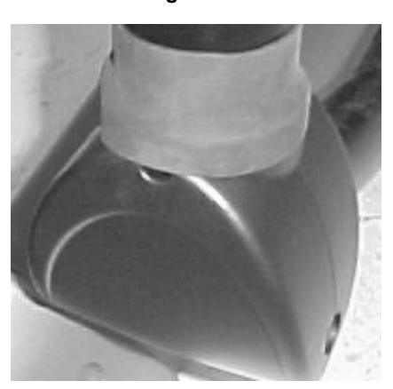
Stretch the Urethene Band Over the Clevis Covers