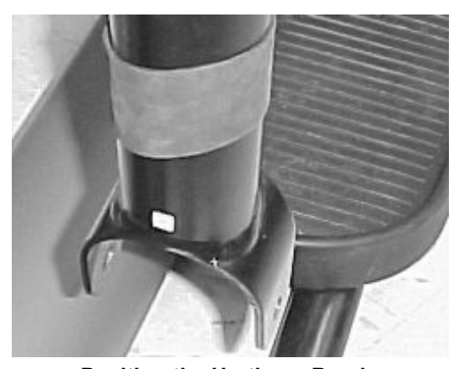
Position the Urethene Band