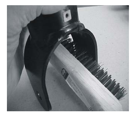
Cleaning the Clevis Horseshoe

7. Install the smooth surface side of the URETHANE BAND over the ROCKER ARM,