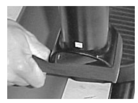
Stretching the Urethene Band

Note: To facilitate installation of the URETHANE BAND, run it under hot water, or apply alcohol to the smooth inside surface. In either case, stretch the URETHANE BAND over the CLEVIS HORSESHOE BRACKET, and then slip it upward approximately 2" on the ROCKER ARM.