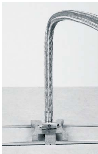
Standard Profile Sprinkler