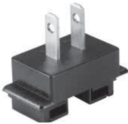
U.S. / Japan plug