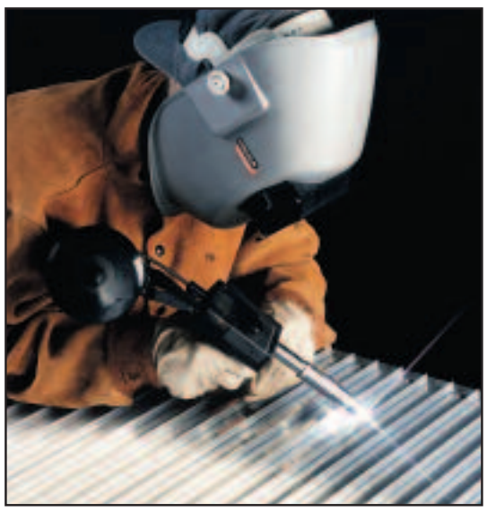
The Magnum® SG Spool Gun is an excellent choice for aluminum sheet metal welding.