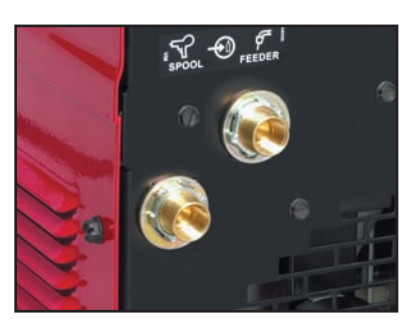
Additional Gas Solenoid – Controls Gas Flow to a Spool Gun

Internal tachometer feedback drive system allows you to maintain constant wire feed speed for consistent welds.