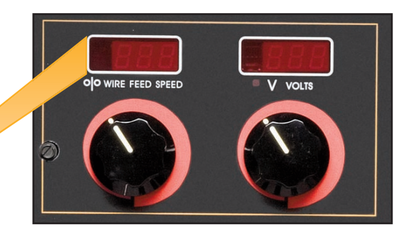
Adjust speed on the gun and watch the wire feed speed change on the POWER MIG® 255XT.