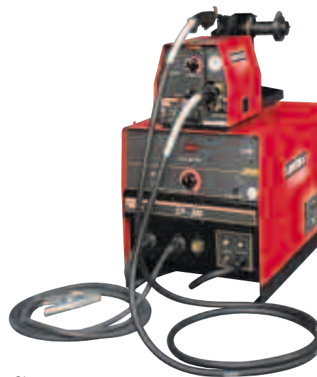
Shown: CV-305 / LF-72 Wire Feeder Ready-Pak® Package

(Order Swivel Kit K2332-1 for even more flexibility! Note: Can't be used at the same time with undercarriage while gas cylinder(s) are installed.)