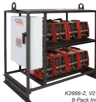
K2666-2, V275-S (Tweco®) 8-Pack Inverter Rack