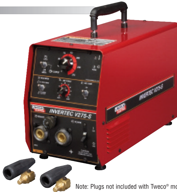
Note: Plugs not included with Tweco® model.