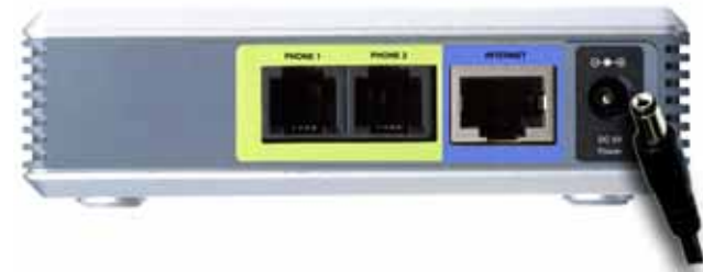
Figure 3-4: Connect the Power Adapter