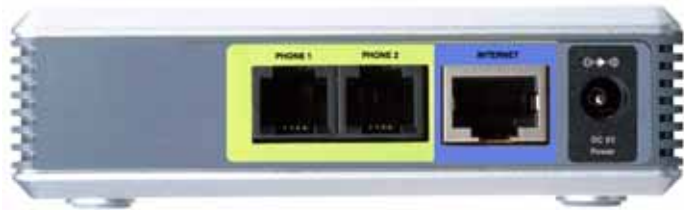
Figure 2-1: Back Panel

The Phone Adapter's ports are located on the back panel.