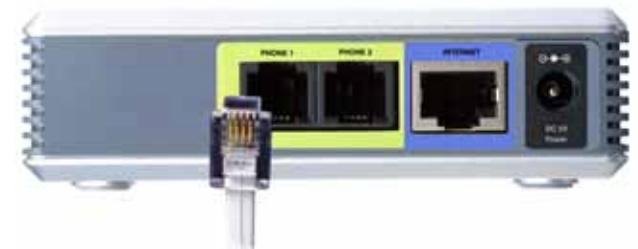
Figure 3-2: Connect the RJ-11 Telephone Cable

IMPORTANT: Do not connect either of the Phone ports to a telephone wall jack. Make sure you only connect a telephone or fax machine to either of the Phone ports. Otherwise, the Phone Adapter or the telephone wiring in your home or office may be damaged.