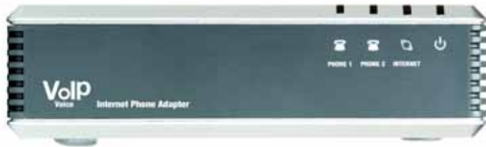
Figure 2-2: Front Panel

The Phone Adapter's LEDs, which inform you about network activities, are located on the front panel.