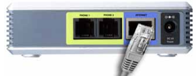
Figure 3-3: Connect the Ethernet Network Cable

The installation of the Phone Adapter is complete. Now you can pick up your phone and make calls.