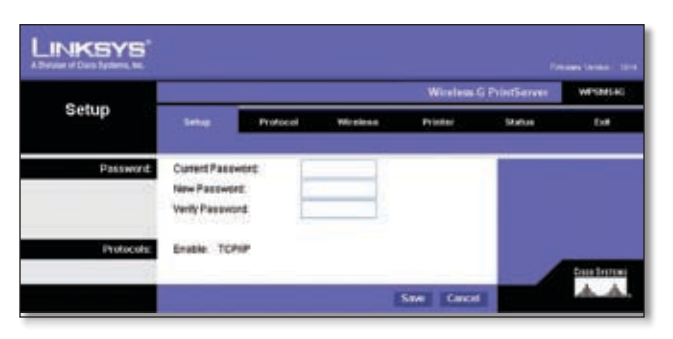
Setup > Setup

The first screen that appears is the Setup tab and allows you to change the PrintServer's general settings.