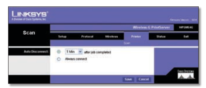
Printer > Scan - Auto Disconnect

1 min after job completed To change the number of minutes before the computer is disconnected from the printer, enter the new number (1-60) in this field.