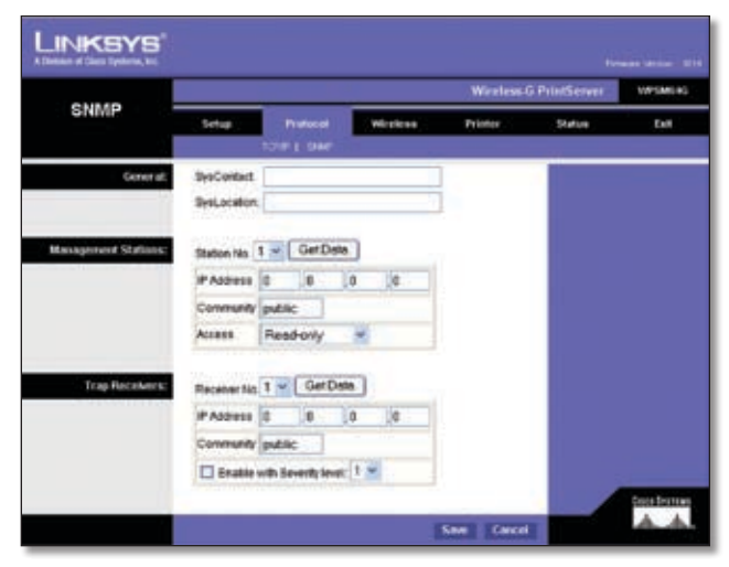
Protocol > SNMP

The appropriate MIB file must be imported into your SNMP management program using the Import-Compile command. Check your program's documentation for details on this procedure. The MIB file is named Mib2p.mib and is provided in the MiB folder on the Setup CD-ROM.