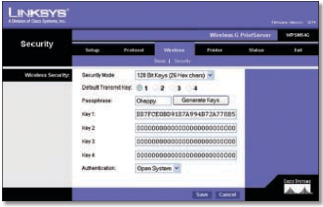
Wireless > Security > WEP

Default Transmit Key Select the Default Transmit Key used by your wireless network. This indicates which WEP key your network uses for WEP encryption.