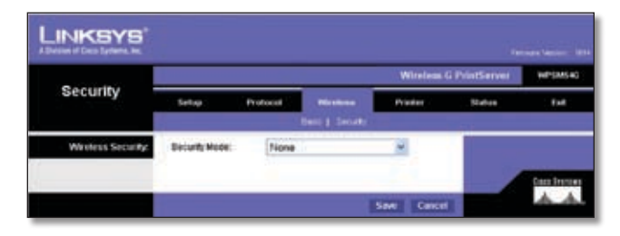
Wireless > Security > None

If you do not want to use wireless security (not recommended), select None from the Security Mode dropdown menu.