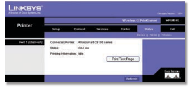
Status > Printer

The Printer screen displays the current settings of the printer. No values can be changed on this screen. Click the Refresh button to update the information on this screen.