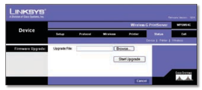
Status > Device - Firmware Upgrade

When you have finished upgrading the PrintServer's firmware, follow these instructions: