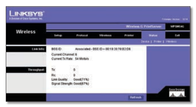
Status > Wireless

The Wireless screen displays status information of the PrintServer's wireless connection. No values can be changed on this screen. Click the Refresh button to update the information on this screen.