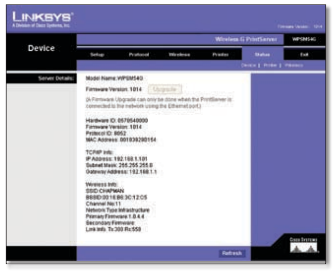
Status > Device - Server Details

Upgrade A firmware upgrade can only be performed when the PrintServer is connected to the network using its Ethernet port. If you want to upgrade the PrintServer's firmware, follow these instructions: