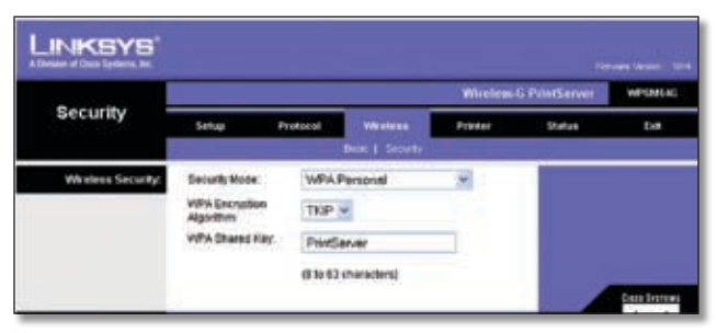
Wireless > Security > WPA Personal > TKIP

WPA Encryption Algorithm TKIP is the default algorithm. AES is also available.