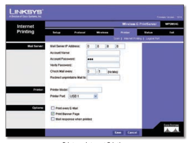
Printer > Internet Printing

Internet Printing allows you to automatically print any e-mails that are sent to a specific e-mail account on your network. This is especially useful for printing information when you are not connected to the network. You can print from any location where you can access e-mail.