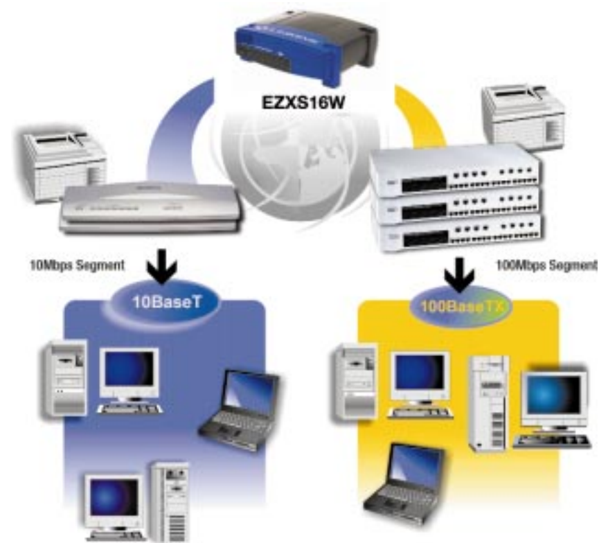
Configuration A (EZXS16W shown)

All of the workstations below can access all resources on the network - 10Mbps users can access the 100Mbps nodes, and vice versa. While allowing the 10Mbps and 100Mbps segments to communicate, the Switch optimizes data traffic by switching the data packets to their destination through the quickest route possible, which improves performance, even on the faster 100Mbps network segment.