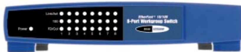
Front Panel - EtherFast 10/100 Workgroup Switch (EZXS88W v2 shown)

The chart below tells you what the front panel LEDs of the 10/100 Workgroup Switches mean. Each Switch has a Power LED on the left side to indicate when the unit is ON.